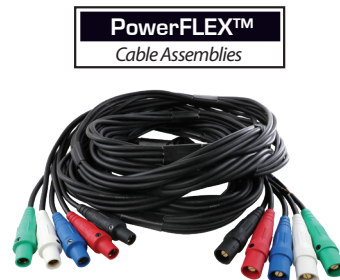
Portable Cable Assemblies