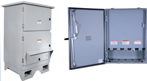
Power Output Panels