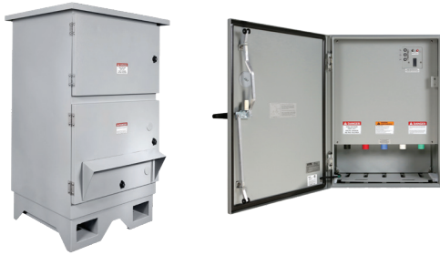
Power Input Panels