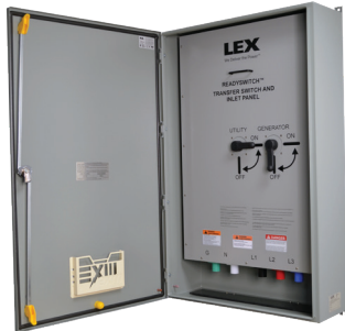
ReadySwitch™ With Manual Transfer Switch