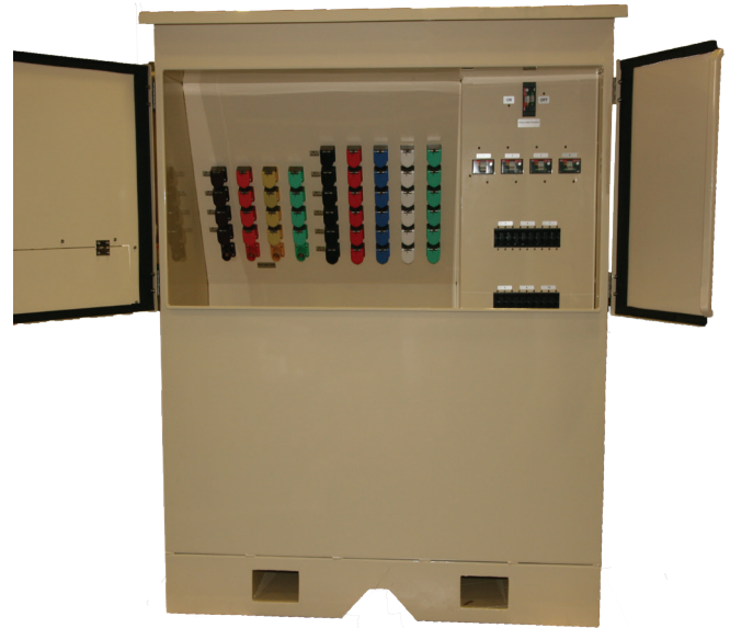
Custom High Amperage Transformer Unit